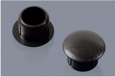
Universal-Verschlussstopfen, Typ UVS Universal seal plugs, type UVS